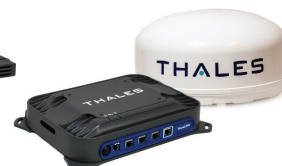
Thales VesseLINK RRP: $7,550.00