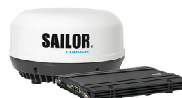
Cobham Sailor 4300 RRP: $6,650.00